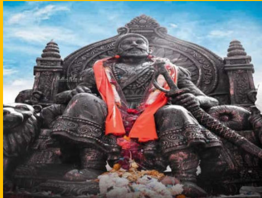
CHHATRAPATI SHIVAJI MAHARAJ JAYANTI