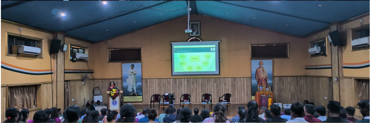
Innovation, Peace & Unity Organized by School of Education and Research MIT Art, Design and Technology, Maharashtra, Pune © 2018/2019/2020