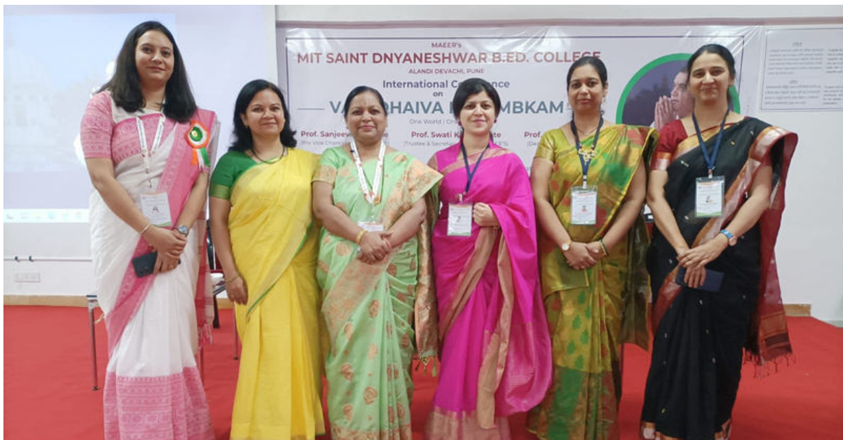
Participation of WPU Faculty during International Conference at SD B.Ed. College

Conclusion: The MoU between Saint Dnyaneshwar B.Ed. College and World Peace University has resulted in a dynamic and fruitful partnership. Through faculty and student exchanges, conference participation, workshops, and special lectures, both institutions have reaped the benefits of shared knowledge and expertise. This collaboration not only enriches the educational experience but also promotes a culture of continuous learning and academic growth.